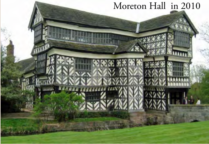
Moreton Hall in 2010