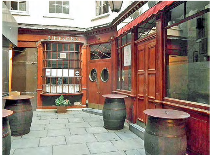
An alley in the City

Please use the booking form on page 9 or send a note with the requested details and your cheque.