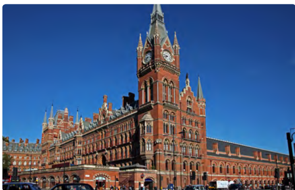
Cover of 2012–13 interest groups booklet