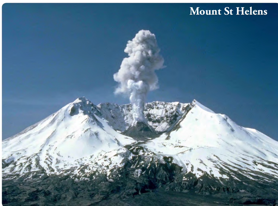
Mount St Helens

Volcanic hotspots (24 at the moment) move slowly as the earth's tectonic plates adjust. Modern monitoring techniques have improved our knowledge about volcanoes; Ann reassured us that there is no known immediate threat of catastrophe.